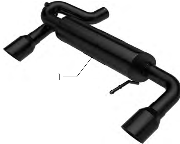
1. MUFFLER ASSEMBLY.