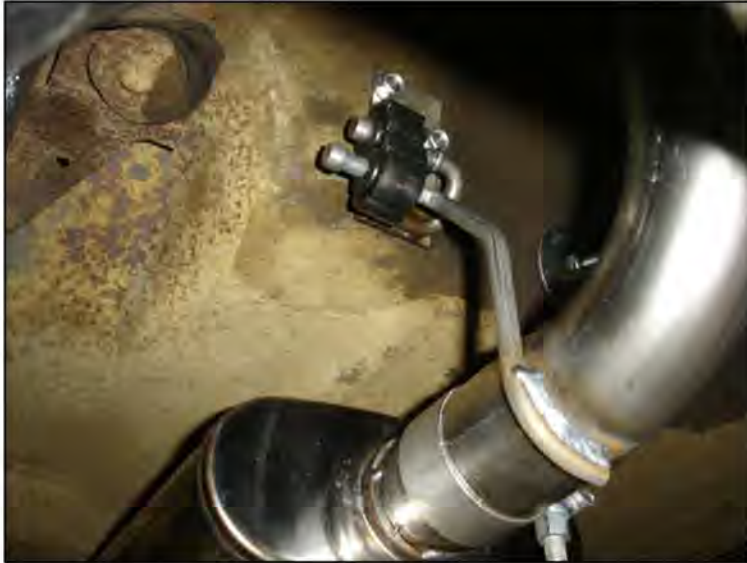
Fig # 1