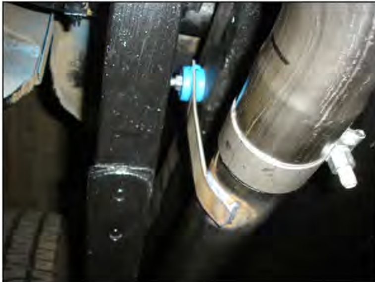
Fig # 2

Step 5: Slip the outlet pipe assemblies to the over axle pipe assemblies. Secure with the supplied clamps. Locate the correct hanger placement on the frame rail adjacent to the leaf springs. Drill 3/8" clearance hole and mount hanger to the frame using the supplied rubber grommet and hardware. (See Fig # 2).