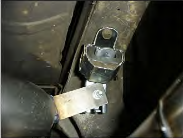
Fig # 1

Warning: When working on, under, or around any vehicle exercise caution. Please allow the vehicle's exhaust system to cool before removal, as exhaust system temperatures may cause severe burns. If working without a lift, always consult vehicle manual for correct lifting specifications. Always wear safety glasses and ensure a safe work area. Serious injury or death could occur if safety measures are not followed.