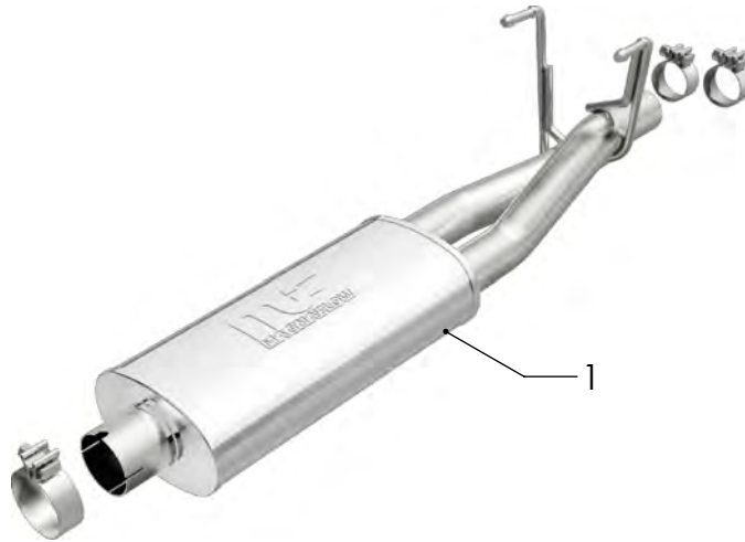
1. MUFFLER ASSEMBLY