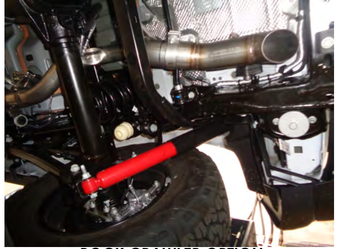
ROCK CRAWLER OPTION

Step 2. Install your new system by first loosely attaching the Inlet Assembly to the DPF with the supplied 2.75" clamp. Engage the welded hanger to the rubber insulator. Keep all clamps loose to allow for final adjustment.