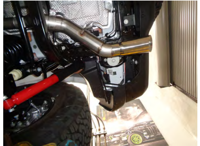
BLACK TAIL PIPE OPTION

Step 3. Your MAGNAFLOW system comes with a choice of a Black Tail Pipe or a "Rock Crawler" Tail Pipe. Both attach in the same way. Attach the Tail Pipe inlet to the Inlet pipe using the supplied 3.00" clamp. Engage the welded hanger to the rubber insulator.