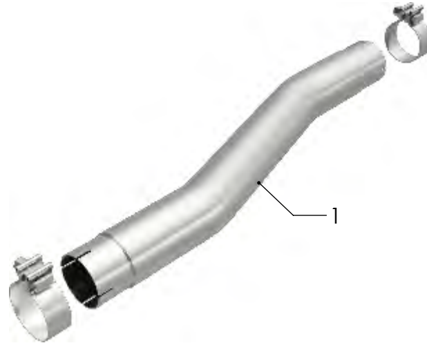
1. MUFFLER DELETE PIPE