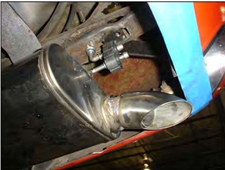
Fig # 2

Step 4: Once a final position has been chosen for the new system, evenly tighten all fasteners from front to rear. The supplied band clamps must be VERY tight to properly align the pipes and prevent leaks (Approximately 40ft-lbs). U-bolt clamps should be tightened to approximately 30-35ft-lbs. Inspect all fasteners after 25-50 miles of operation and retighten if necessary.