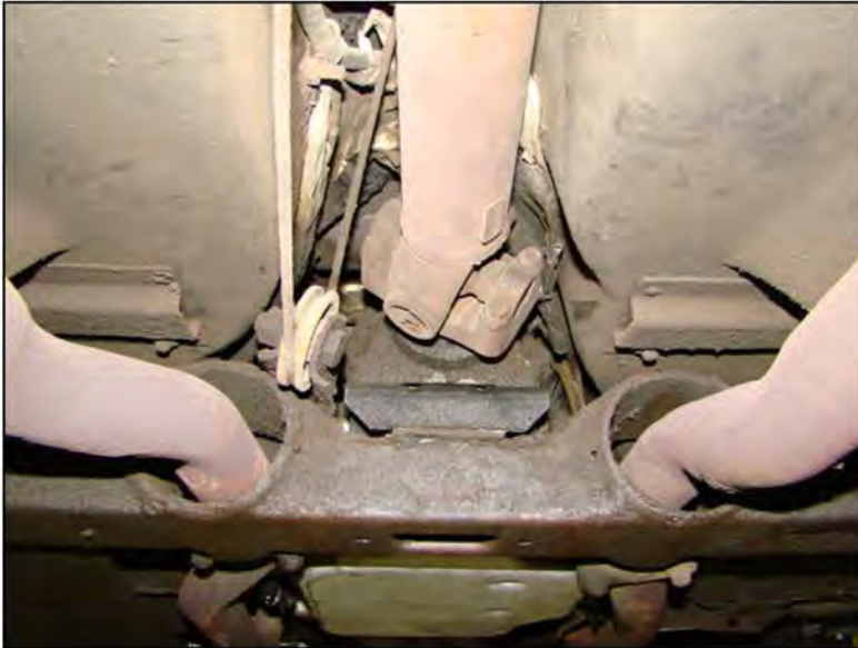
Fig # 1

Step 4: Once a final position has been chosen for the new system, evenly tighten all fasteners from front to rear. The supplied band clamps must be VERY tight to properly align the pipes and prevent leaks (Approximately 40ft-lbs). U-bolt clamps should be tightened to approximately 30-35ft-lbs. Inspect all fasteners after 25-50 miles of operation and retighten if necessary.