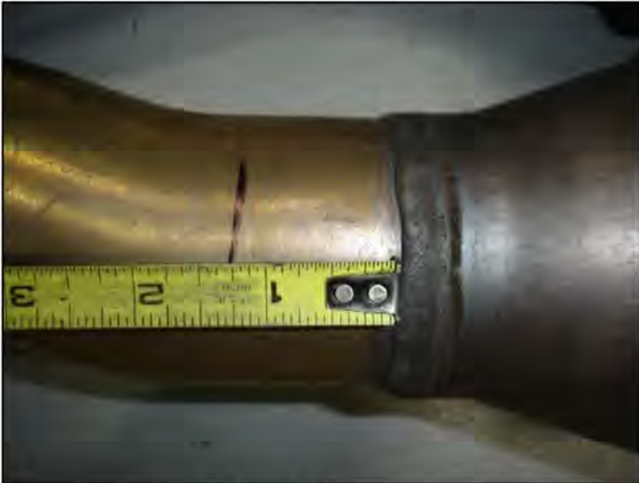
Fig # 1

Warning: When working on, under, or around any vehicle exercise caution. Please allow the vehicle's exhaust system to cool before removal, as exhaust system temperatures may cause severe burns. If working without a lift, always consult vehicle manual for correct lifting specifications. Always wear safety glasses and ensure a safe work area. Serious injury or death could occur if safety measures are not followed.