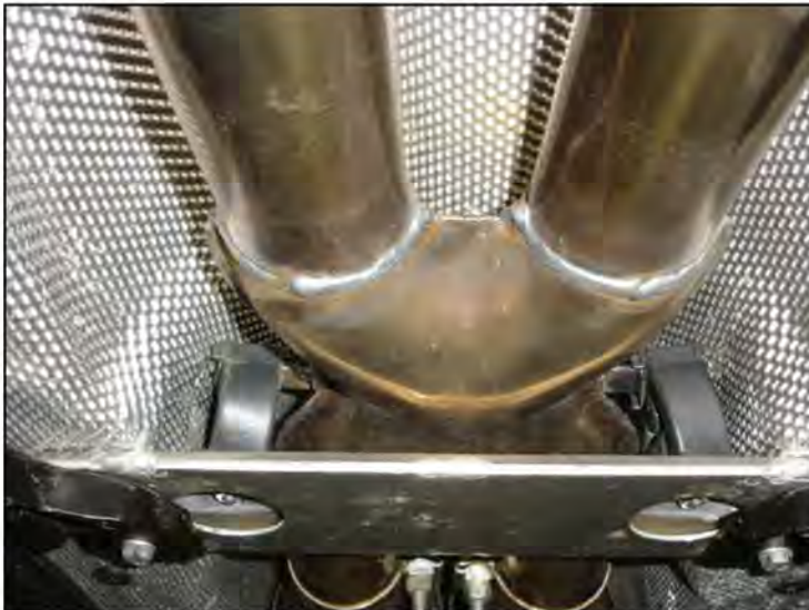
Fig # 2

Step 5: Once a final position has been chosen for the new system, evenly tighten all fasteners from front to rear. The supplied band clamps must be VERY tight to properly align the pipes and prevent leaks (Approximately 40ft-lbs). U-bolt clamps should be tightened to approximately 30-35ft-lbs. Inspect all fasteners after 25-50 miles of operation and retighten if necessary.