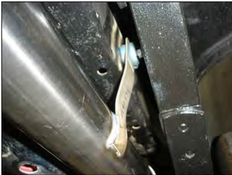
Fig. # 2

Step 7: Once a final position has been chosen for the new system, evenly tighten all fasteners from front to rear. Inspect all fasteners after 25-50 miles of operation and retighten if necessary.