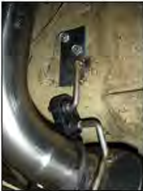
DIAGRAM 2 DRIVER'S SIDE