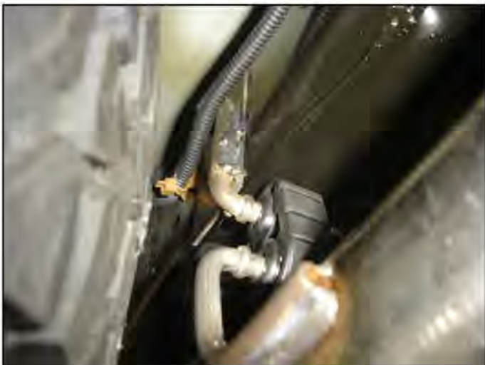
Dia # 3

Warning: When working on, under, or around any vehicle exercise caution. Please allow the vehicle's exhaust system to cool before removal, as exhaust system temperatures may cause severe burns. If working without a lift, always consult vehicle manual for correct lifting specifications. Always wear safety glasses and ensure a safe work area. Serious injury or death could occur if safety measures are not followed.