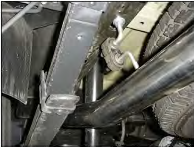
Dia # 2