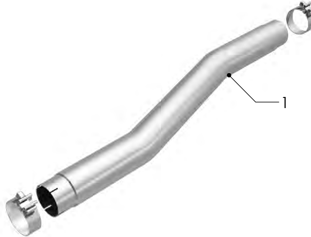
1. MUFFLER DELETE PIPE